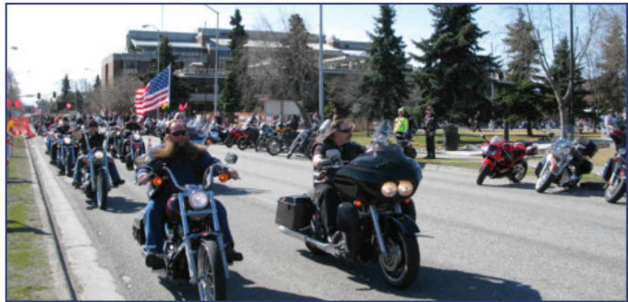
ABATE of Alaska and City Church Bike Blessing Over 1000 Bikes!!!

Loud Pipes Saves Lives . . .4 Ask Our Lawyer . . . . .5 Reports. . . . . 10 Self Driving Google Car . 14